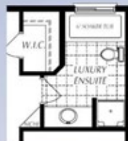
OPTIONAL LUXURY ENSUITE