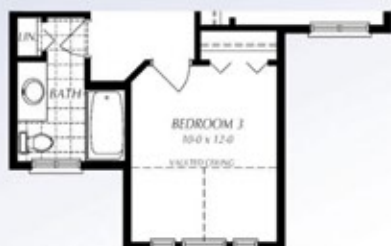
PARTIAL SECOND FLOOR PLAN Galaxy Series