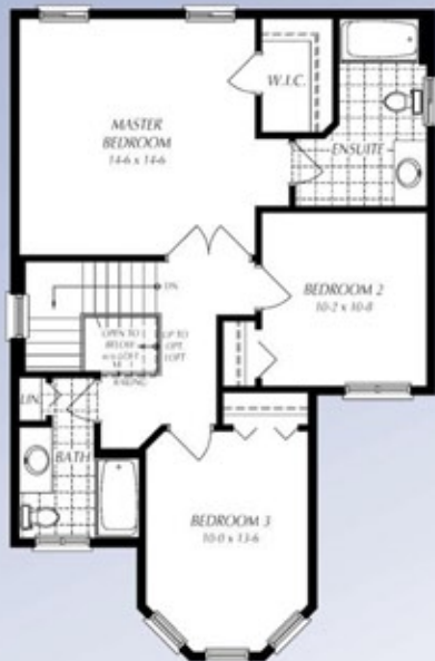
SECOND FLOOR PLAN Solar Series