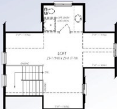
OPTIONAL LOFT FLOOR PLAN