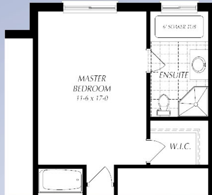
OPTIONAL LUXURY ENSUITE