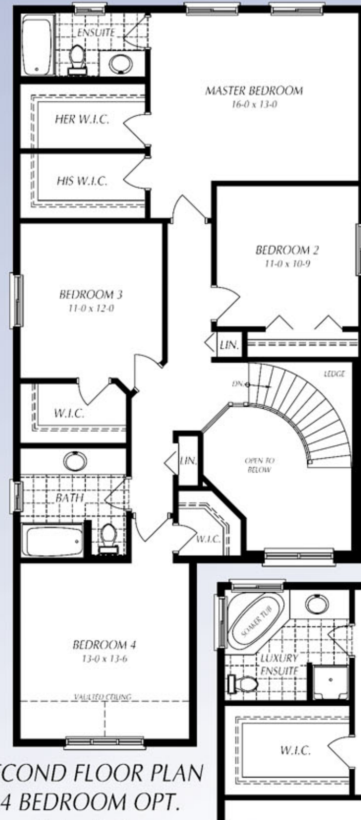
SECOND FLOOR PLAN 4 BEDROOM OPT. Solar Series