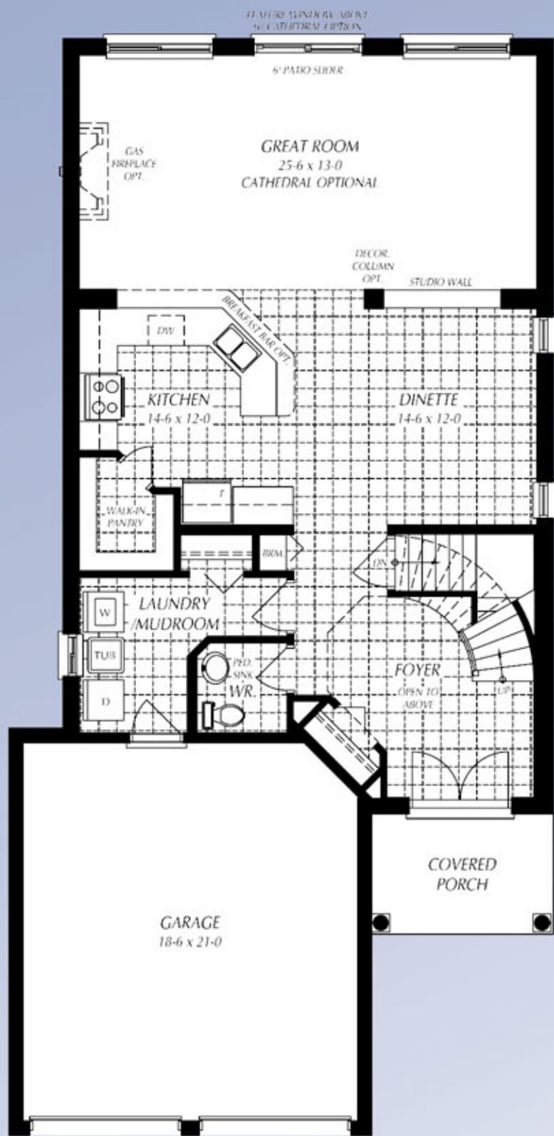
MAIN FLOOR PLAN Solar Series